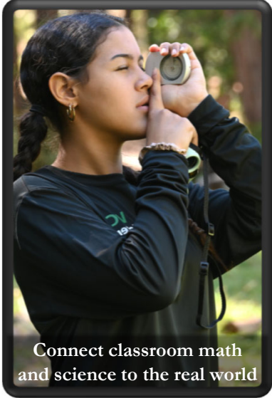
Connect classroom math and science to the real world