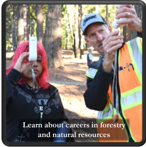
Learn about careers in forestry and natural resources