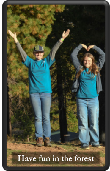
Have fun in the forest